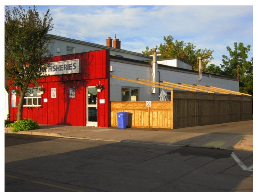
Minor Fisheries with summer patio

With the success of the restaurant, the introduction of new processing equipment and the demands of regulatory requirements the Minors decided Minor Fisheries had finally outgrown its West Street location and a new modern processing plant was built on Elm St. in 2008.