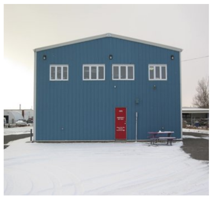
Minor Fisheries processing facility

With the success of the restaurant, the introduction of new processing equipment and the demands of regulatory requirements the Minors decided Minor Fisheries had finally outgrown its West Street location and a new modern processing plant was built on Elm St. in 2008.